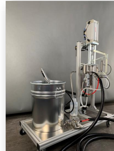
Gelcoater 44 on mobile cart