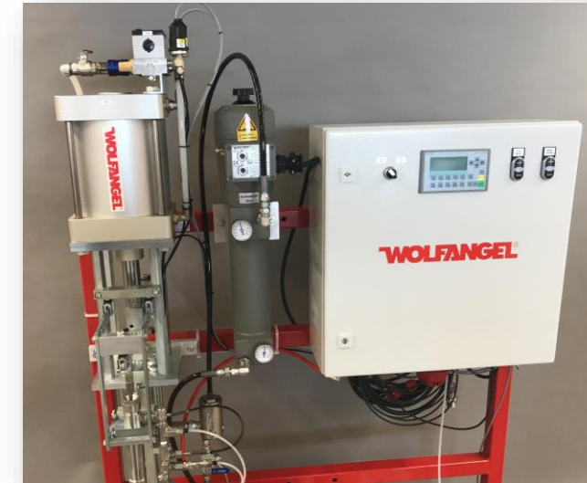
Gelcoater 150 with optional gelcoat heater and Spray Progress Display